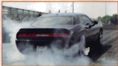
In the uphill burnout box at Quaker City, this car shows what most entries had — the ability to cook the tires and street-legal registration.