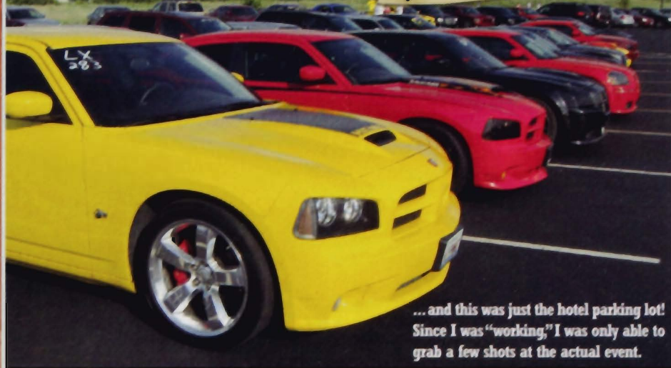
... and this was just the hotel parking lot! Since I was "working," I was only able to grab a few shots at the actual event.