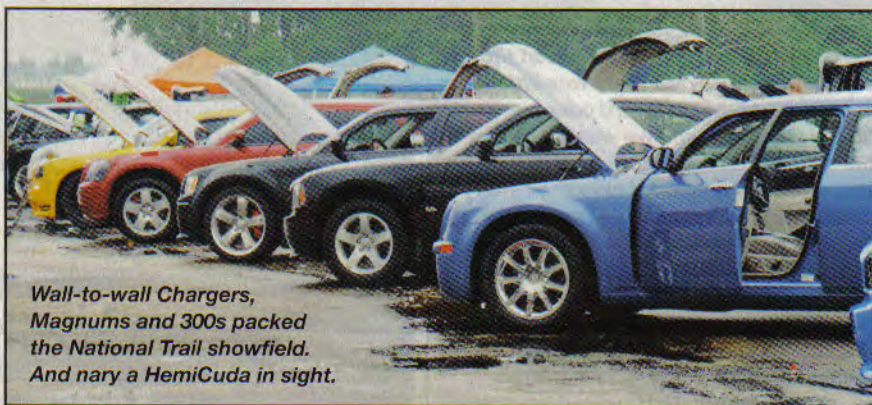
Wall-to-wall Chargers, Magnums and 300s packed the National Trail showfield. And nary a HemiCuda in sight.

When the cosmic dust cleared, images from the Hubble telescope confirmed the existence of an LX Nationals at National Trail Raceway, Columbus, OH, (Aug. 14-15), where one had never existed before. Naturally, the folks at NASA were excited