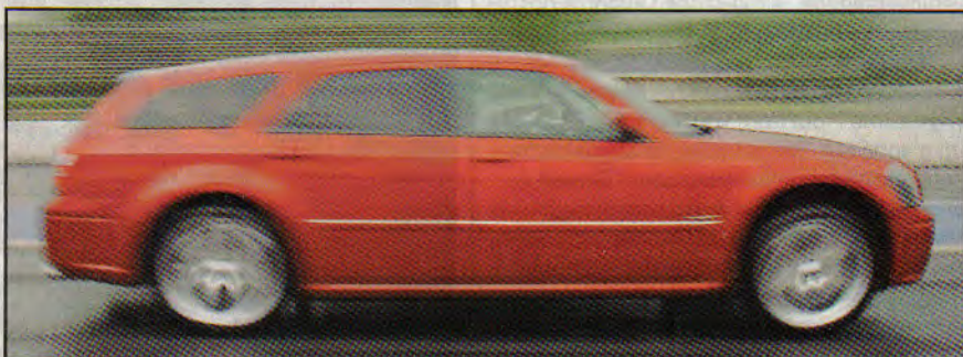
It was racing between the raindrops on Saturday, with dry conditions on Sunday.