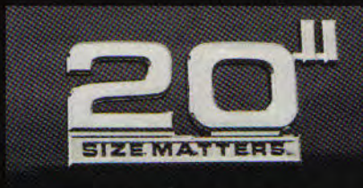
A big hit with the ladies was this fan's "woody," with its shameless fender badge.